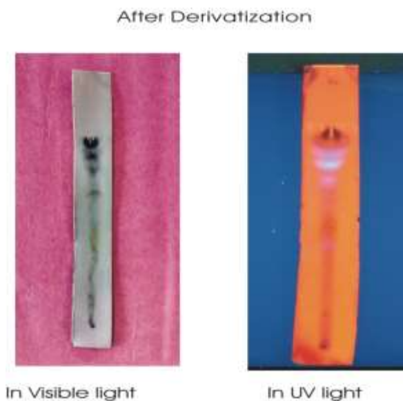
Fig. 2: TLC plate of chloroform extract (After derivatization)